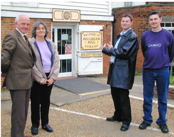
April 2005 Meeting with Interact and Essex County Mind & Spirit Steering Group at Moulsham Mill in Chelmsford